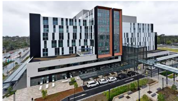
📷 Northern Beaches Hospital at Frenchs Forest.

Subscriber only | August 25, 2020 1:30pm