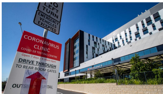
Northern Beaches Hospital in Frenchs Forest on March 31, 2020 showing signage for the new system for COVID-19 testing.

As cases rise the number of specialised COVID-19 teams will be increased from one every shift, to two, then three and so on.