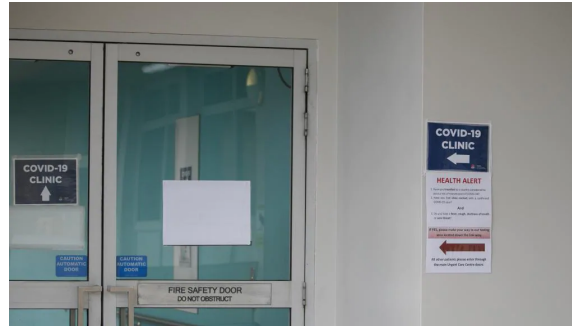
📷 Mona Vale Hospital has a COVID-19 clinic.

At Northern Beaches Hospital on Tuesday people concerned they had the virus were being met outside the front of the emergency department by a triage nurse decked in protective glasses, a mask, gloves and a disposal gown, before being escorted for testing if found to meet the criteria.