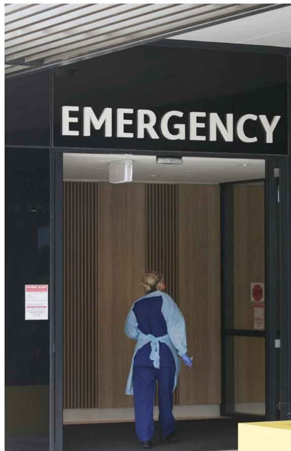
📷 A triage nurse who was assessing patients at the new COVID-19 clinic at Northern Beaches Hospital.