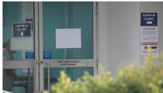
📷 Mona Vale Hospital also has a COVID-19 clinic.

It is also understood a second person has also been admitted, although NSW Health was not able to confirm this at the time of publication.