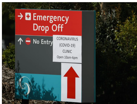
📷 Northern Beaches Hospital is trialling a COVID-19 clinic.

She said patients who had been to the new COVID-19 clinics had reported the system was efficient and they were in and out within a few hours.