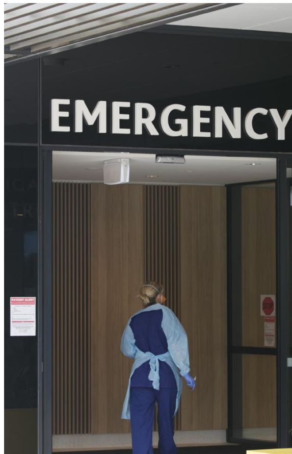
📷 Northern Beaches Hospital has set up an exclusive area for people suffering from symptoms of the coronavirus.

There had been a steady stream of people requesting tests all day, according to an observer with four waiting when the Manly Daily arrived.