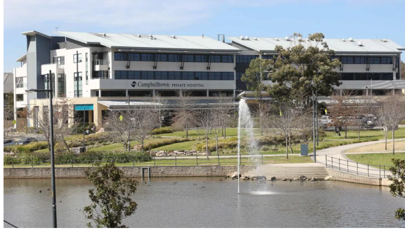
📷 Campbelltown Private Hospital and Park Central.